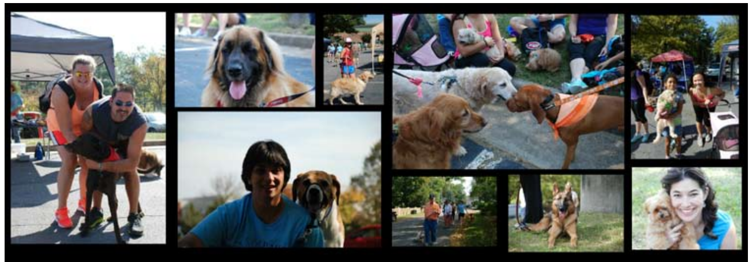
Enjoy pictures from the 18th Annual Paws for a Cause 3K Walk.

Visit www.fpow.org/events for more pictures.